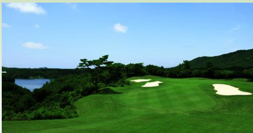
Kintetsu Kashikojima Country Club