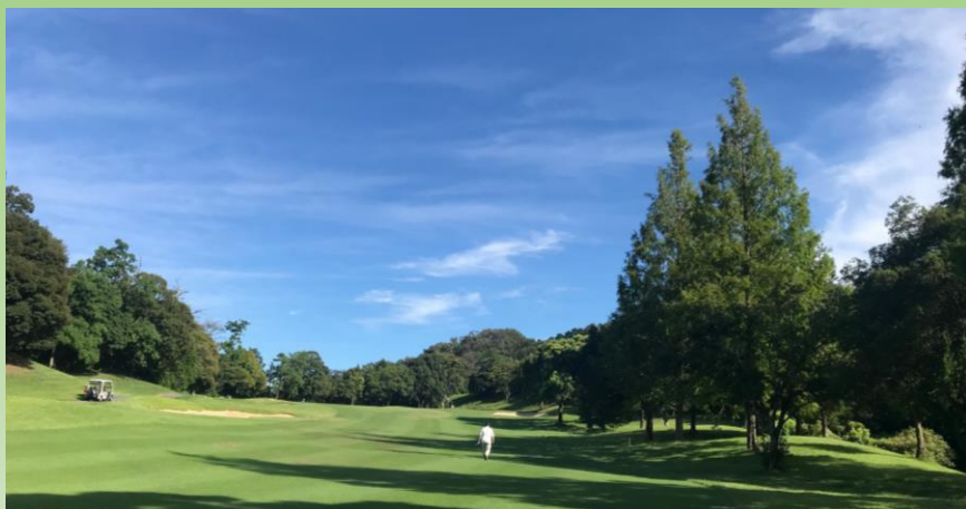
Matsusaka Country Club