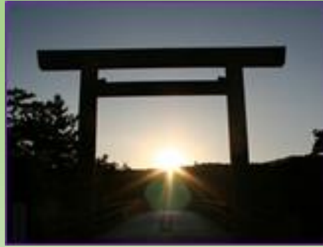
Ise Jingu Grand Shrine