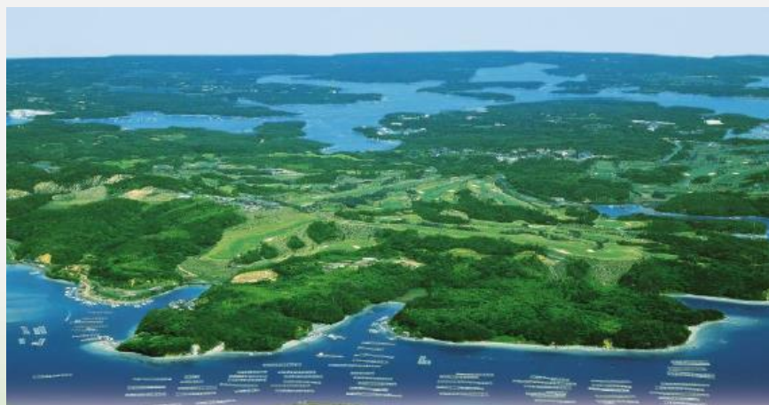
Kintetsu Hamajima Country Club