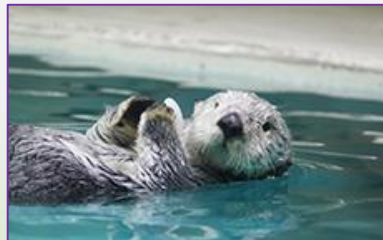
Mikimoto Pearl Island