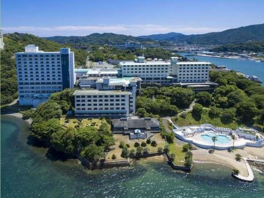
Toba Seaside Hotel